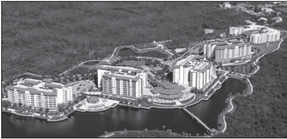
Shell Point Retirement Community

Shell Point Retirement Community is a not-for-profit continuing care retirement community located in Fort Myers off Summerlin Road. Shell Point has received national accreditation from CARF-CCAC, and is a nationally recognized leader in the retirement industry. The community offers retirement living in a resort-style environment with an 18-hole championship golf course, deep water boating access, and recreational and fitness facilities. To learn more about Shell Point, visit www.shell-point.org or call 1-800-780-1131. ■