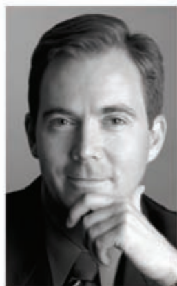
THE ONLY FELLOWSHIP TRAINED, DOUBLE BOARD CERTIFIED, FACIAL PLASTIC SURGEON IN FT. MYERS.

Call 239.437.3900 or visit our website at www.DrPrendiville.com or Our page at www.fox4now.com (click on healthnow) 9407 Cypress Lake Drive, Unit A Fort Myers, Florida 33919