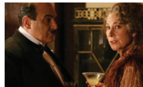
"Masterpiece Mystery!" Poirot

Poirot: Mrs. McGinty's Dead Mrs. McGinty was killed by a brutal blow to the head, and her lodger is sentenced to hang for the murder. As Mr. Poirot joins forces with famed crime novelist Ariadne Oliver to save the lodger from the gallows, he doesn't realize his own life is in danger. Featuring an all-star cast.