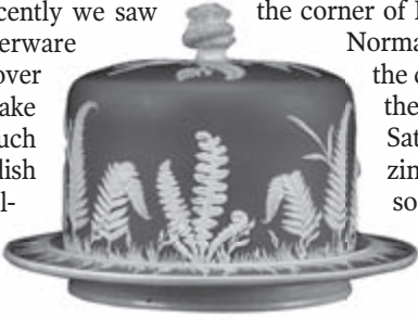
This jasperware covered dish is 12½ inches in diameter. The fern and cattail decoration was used on similar dishes made by Dudson Pottery, makers of pottery in England since about 1900. The dish sold for $153 at Jackson's Auctioneers of Cedar Falls, Iowa.

Several museums have "What is it?" exhibits that display unusual items in the hope that someone will recognize a rarely used specialized tool or a pot for an ethnic dish unfamiliar to us today. Recently we saw a 12½-inch-diameter jasperware dish with an 8-inch-high cover sold at auction as a "pancake server." It looks very much like a 19th century English dish made to hold a round of stilton cheese. Or it could be a pottery cake dish and cover similar to the plastic cake carrying dishes made today. Research in books and online and conversations with experts have not provided a definitive answer. We are still not sure how the dish