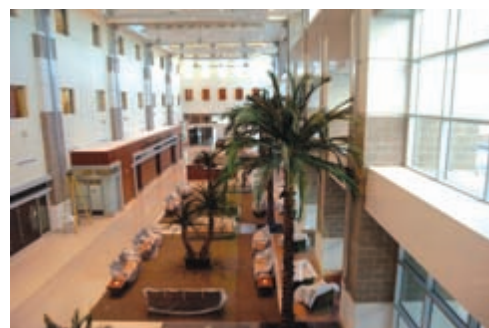
The view of the new atrium from a second-floor patient's room.

{ ... an evolving health system struggles }