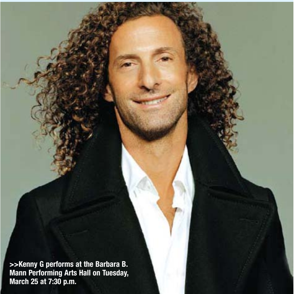
>>Kenny G performs at the Barbara B. Mann Performing Arts Hall on Tuesday, March 25 at 7:30 p.m.