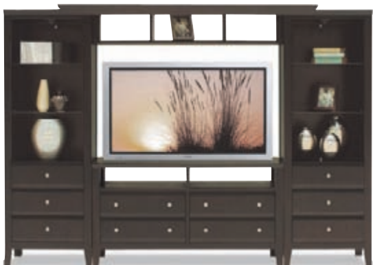
Wall Unit ..... $1199 Wall Unit includes 52" TV Stand, Two Pier Units, and Adjustable Bridge with Display Shelf. 52" TV Stand $299. 62" TV Stand $399. Projection Wall $899.