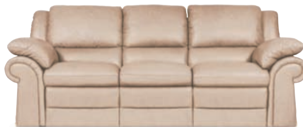
Reclining All-Leather Sofa ..... $999 Reclining Leather Sofa and Reclining Loveseat $1969. Matching Recliner $799. Your choice of Taupe or Black.