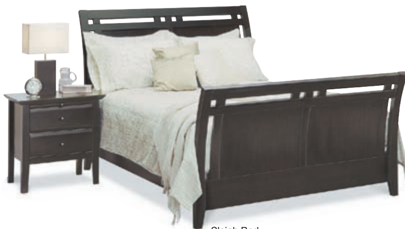
Sleigh Bed ..... $399 Bed includes Queen Headboard, Footboard, and Rails. Bedroom includes Queen Sleigh Bed, Dresser, and Mirror for $999. Available in King, Full, or Twin.