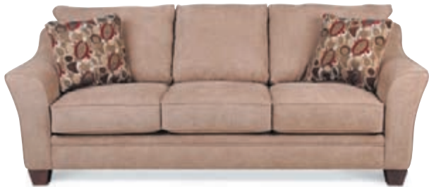
Microfiber Sofa ..... $499 Microfiber Sofa and Loveseat $969. Matching Chair $399 and Sleeper $699. Your choice of Mocha or Taupe.