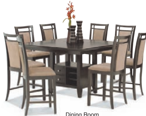
Dining Room ..... $799 Dining Room includes High Dining Table and Four Barstools. Matching Buffet and China $999.