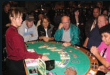
Gambling at the Seminole Immokalee Casino.