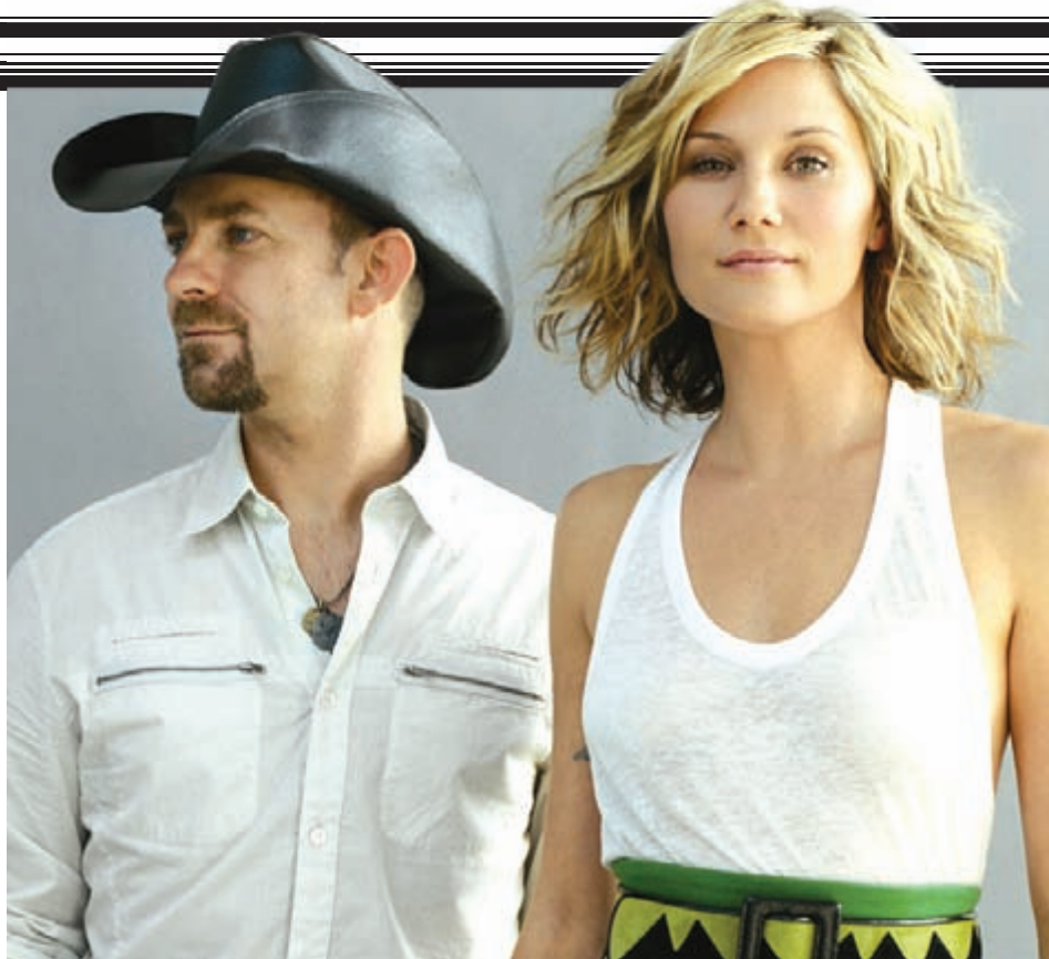
>>>Sugarland will headline the second annual "Sam Galloway Ford Lakeside Country Bash" at Lakes Park on Nov. 8.