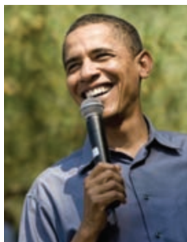
BARACKOBAMA.COM AND JOHNMcCAIN.COM