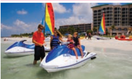
Dolphin Tours by Jet Ski

Package includes FREE BREAKFAST for two every day and two FREE WELCOME COCKTAILS .