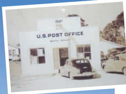
Above, Bonita Springs in the mid-20th century.