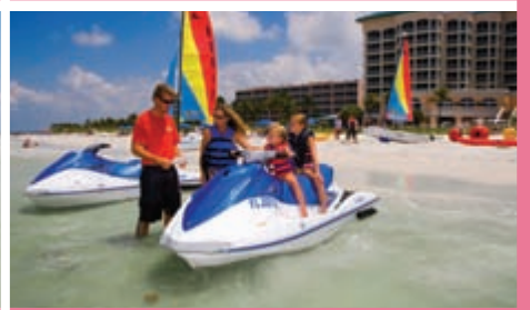
Numerous Water Sports

Package includes FREE BREAKFAST for two every day and two FREE WELCOME DRINKS .