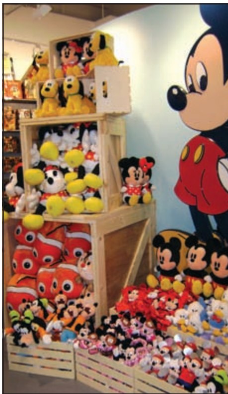
Disney warehouse at Miromar Outlets.

Miromar Outlets has announced the opening of the Disney's Character Warehouse. The 3,195-square-foot store carries men's, women's and children's apparel, housewares, plush and other toys, jewelry, timepieces and home decorative items with savings from 50 to 70 percent off merchandise carried in the Disney theme park gift shops. The Disney's Character Warehouse is located in