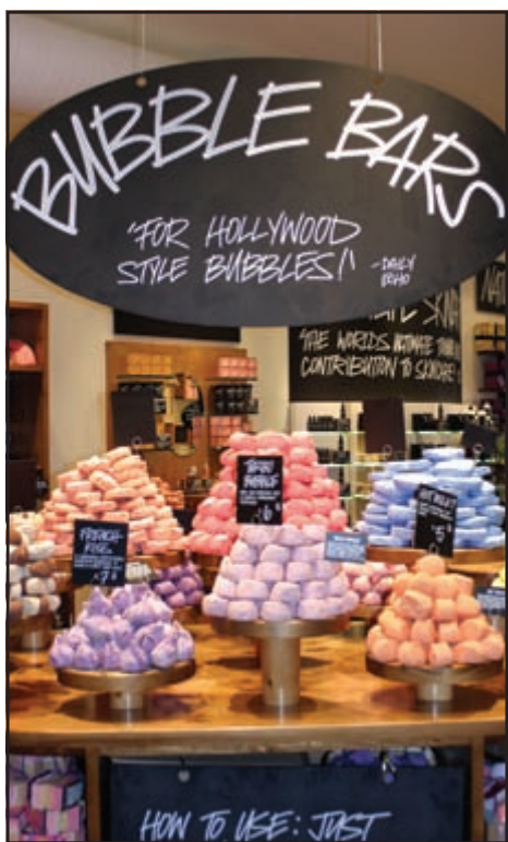
LUSH's new shop in the Edison Mall recently opened.

LUSH, the up-beat British brand of fresh handmade cosmetics has put their distinct beauty mark on the face of Fort Myers for the very first time. Known for its ethical and innovative approach to bath, body, skin care and hair care, the self-appointed cosmetic grocer made its debut at Macy's in Edison Mall last month.