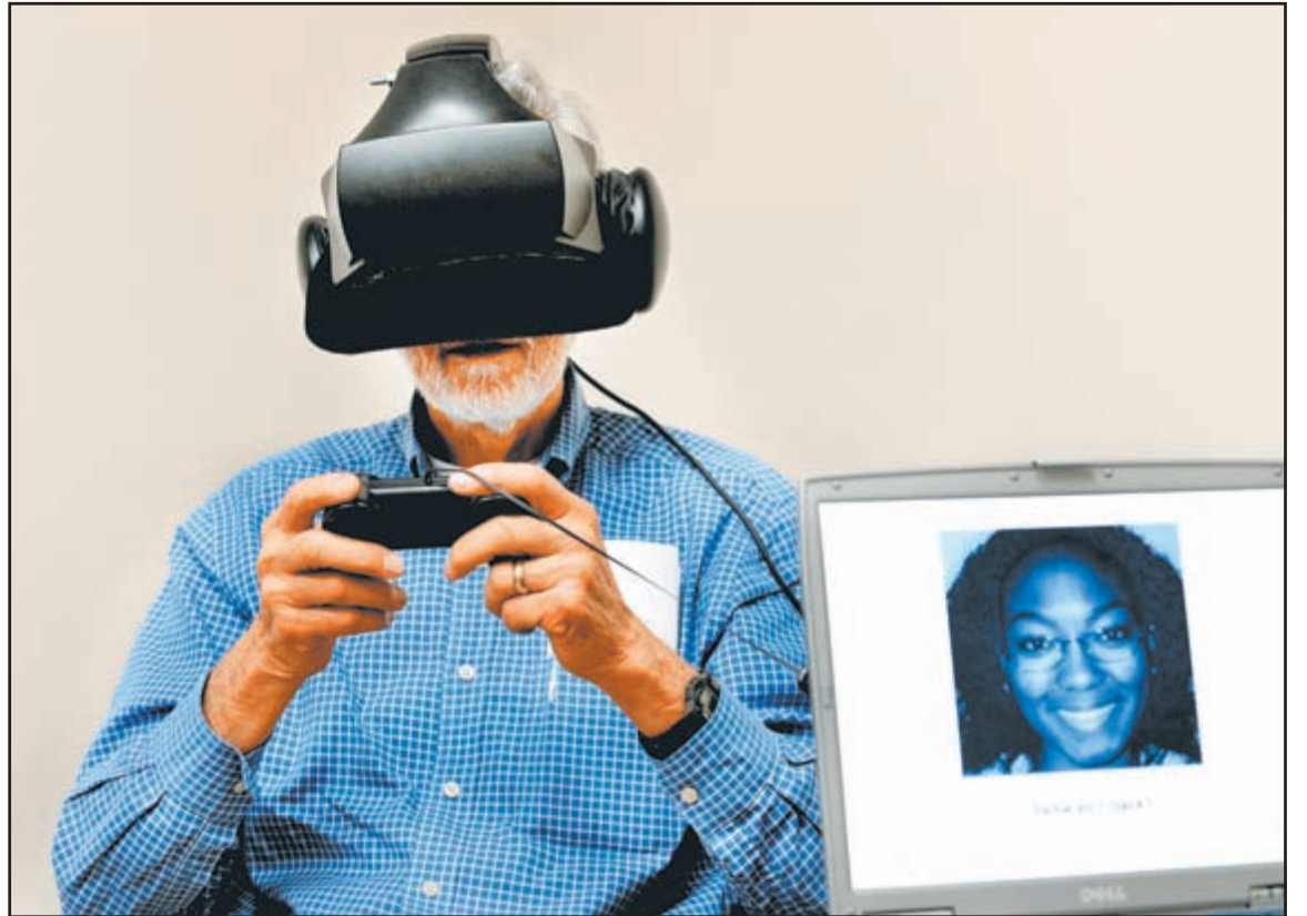
An elderly man is screened for Alzheimer's disease with a test that involves identifying faces in photographs at Emory University in Atlanta.

Newer drugs, while better, still only treat symptoms, making