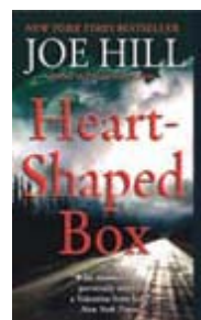
Joe Hill's books Heart-Shaped Box and 20th Century Ghosts

In Joe Hill's world, a sixth grade boy befriends a classmate (who happens to be an inflatable boy), a ghost who kisses like a movie star and knows every film ever made inhabits a movie theater, a man transforms into an eight-foot-tall locust, and an IBM electric typewriter in the basement types stories on its own every night.