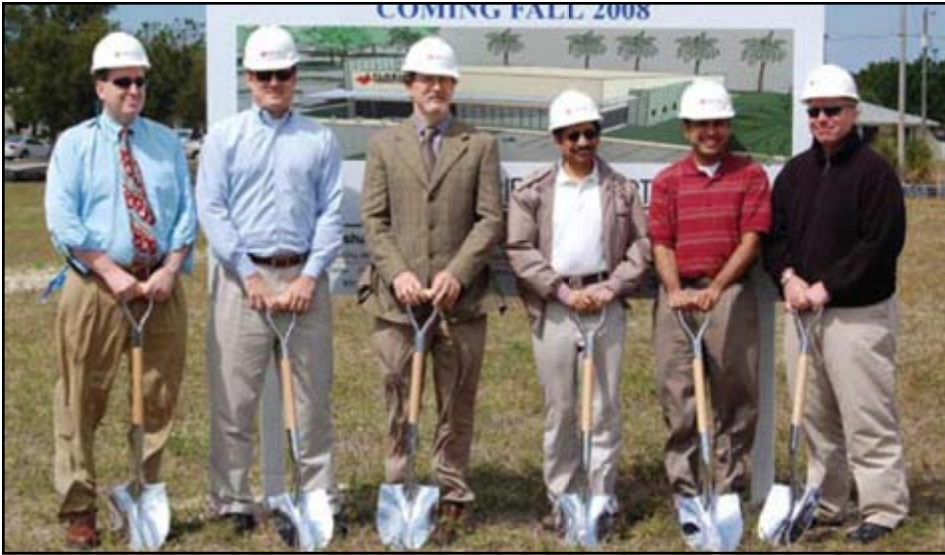
The Florida Heart Associates' partners wait the signal to break ground on their new facility.