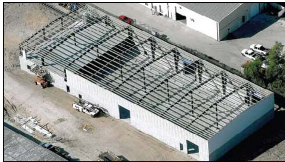
Total Truck Parts store in Billy Creek Commerce Park in Fort Myers.