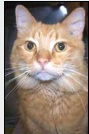
>>Tiger Tiger, (393767) is a neutered male Maine Coon. He is declawed and very striking with his thick coat and beautiful golden eyes.