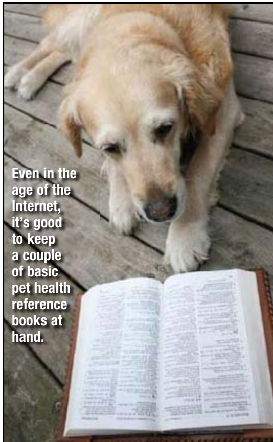
Even in the age of the Internet, it's good to keep a couple of basic pet health reference books at hand.

Also on the cutting edge are two new books on pet first aid from the American Red Cross. While there's nothing new about pet health emergencies, some recent hurricanes, floods and fires have underscored the need for resources to cope with them. And these two spiral-bound books — one for dogs and one for cats — are great resources. Each book comes with a companion DVD that gives step-by-step instructions on how to give first aid to pets. The sections on animal poisoning are particularly impressive, as is the information on what to do in