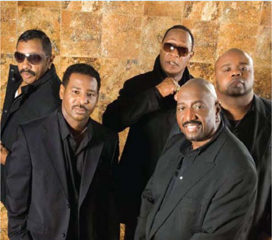
>>The Temptations (pictured above) and The Four Tops perform at the Barbara B. Mann Performing Arts Hall on Monday, March 17.