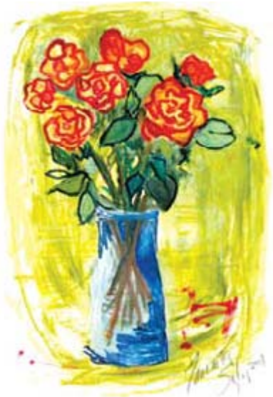
NAPLES MUSEUM OF ART

WEEK OF FEB. 28-MARCH 5, 2008 A GUIDE TO THE GREATER FORT MYERS ARTS & ENTERTAINMENT SCENE