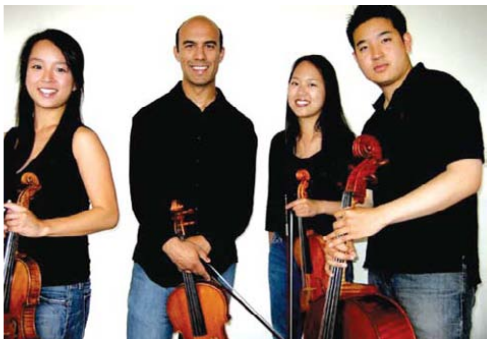
>> Afiara String Quartet performs at the Foulds Theatre at the Alliance for the Arts on Feb. 25.

■ Anne Murray - Anne Murray's signature voice has graced the airwaves on recordings since 1968. She will perform at the Barbara B. Mann Performing Arts Hall on Thursday, March 6 at 7:30 p.m. A consummate entertainer, her quick wit and easy sense of humor find their place on stage alongside a string of hits