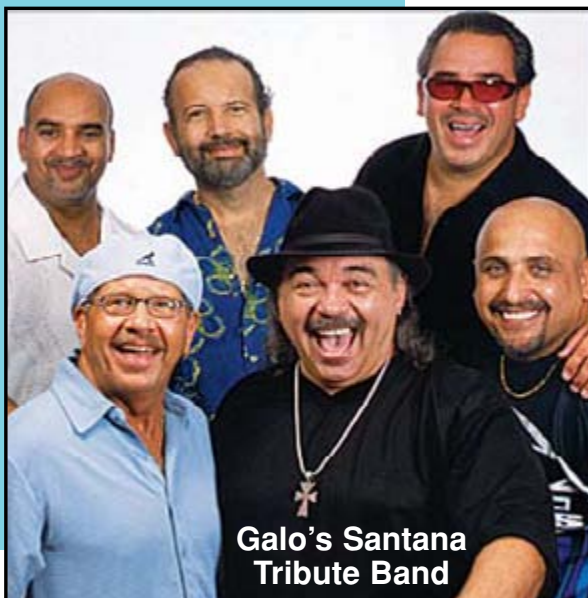
Galo's Santana Tribute Band