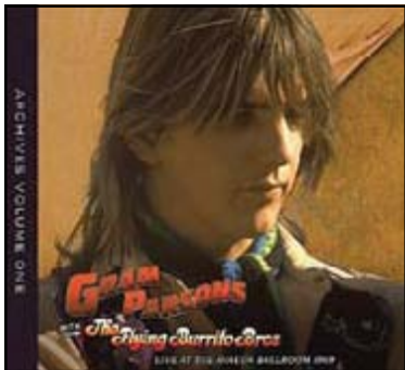
Gram Parsons Archive, Vol. 1: Live at the Avalon Ballroom 1969 - Amoeba Records

Gram Parsons Archive, Vol. 1: Live at the Avalon Ballroom 1969