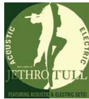
>>Jethro Tull performs at the Barbara B. Mann Performing Arts Hall Dec.14.