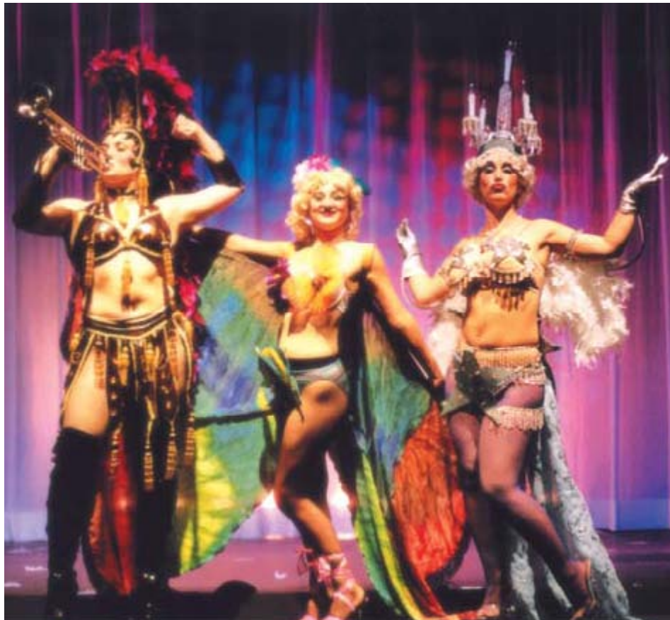
>>Gypsy is onstage at the Naples Philharmonic Center for the Arts Dec. 18 and 19.

■ The Nutcracker - Broadway Palm Children's Theatre presents The Nutcracker playing Dec. 7*, 9, 11*, 14*, 15, 18*, 21* and 23, 2007. The holiday classic is about a young girl who is given a beautiful nutcracker. She dreams that it comes to life and battles against the Mouse King and his army. The nutcracker defeats the mouse king and is transformed into a prince. All performances begin with a buffet at noon and show time at 1 p.m. (except where indicated*, lunch is at 10:30 a.m. and the show is at 11:30 a.m.) The chef's special buffet includes children's favorites like hamburgers, hot dogs, french fries, chicken and more. Ticket prices for lunch and the show are only $15 for all ages. Tickets are now on sale and can be reserved by calling (239) 278-4422, by visiting www.BroadwayPalm.com , or by stopping by the box office at 1380 Colonial Boulevard.