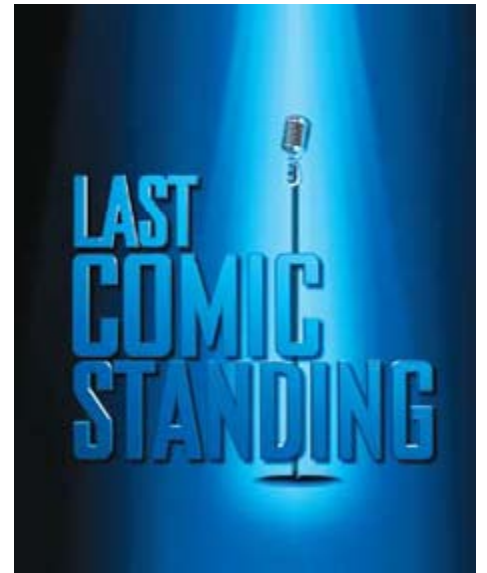
>>Last Comic standing finalists perform at the Barbara B. Mann Performing Arts Hall Dec. 13.