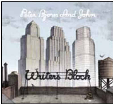
Writer's Block - Almost Gold Records