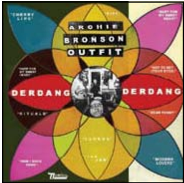
Derdang Derdang - Domino Records