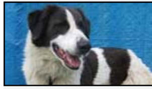
>>Bandit (267024) is a sweet, five-year-old border collie whose owner turned him in because the landlord didn't allow dogs. He loves kids.