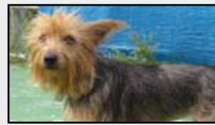
>>Daisy (338122) is a three-year-old silky terrier who was surrendered by her owner due to a divorce. She sits on command and can jump from the ground into your arms.