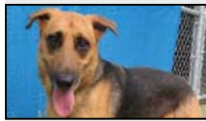
>>Ellie Mae (381028) is a 3-year-old German shepherd. She's smaller than average, making her an ideal house pet.

(normally $65) and $40 for cats (normally $50). The fee includes spay/neuter surgery, vaccinations appropriate for each animal's age, flea treatment, worming, heartworm test for dogs six months or older, feline aids and leukemia test for cats, a county license for pets three months or older, collar, training DVD, nationally registered microchip pet ID, and a gift pack of toys and treats. The total adoption package is valued at more than $400. Here are some of the many animals ready for forever homes: