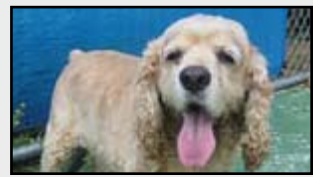
>>Rosie (380961) is an older cocker spaniel who wound up at the shelter when her owner died. She is a happy, loving girl whose maturity will make her a pet that will fit easily into a new home.