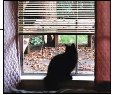
Keep your cat contained before and after your moving day.

By limiting your cat's options to the litter box and scratching post in his small safe room, he will quickly redevelop the good habits he had in your old home. ■