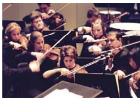
SPECIAL TO FLORIDA WEEKLY

■ Inside: Where else is the Southwest Florida Symphony playing around town? C4