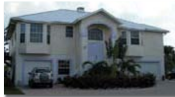
PALM ISLES , 11651 Isle Of Palms Dr - Home w/hd Pool/Spa. Property on canal/pvt preserve views. Boathouse, lift & 200+ Ft of dock. Unrestricted boat quick Gulf access. 4+ Car Gar & Bonus Rms. 3+Den/2 (H1588) Mary Spellman, 851-9459 $1,499,000