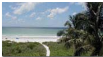
SOUTH SEAS ISLAND RESORT , 1073 South Seas Plantation Rd - Enjoy spectacular sunsets from the privacy of your own home. Fantastic views of the Gulf from nearly every room. Patios and lanais on each level. 3/3 (H2623) Giovina Mimmo, 878-1748 $3,000,000