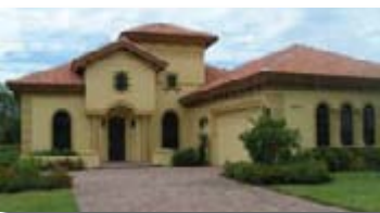
PASEO , 11878 Rosalinda Ct - Perfect Montessa floorplan shows up lakefront with preserve backdrop. Pool & spa set in oversized paved lanai. Upgraded kitchen. Ready to move in!. 3+Den/2 (H2737) Mary Spellman, 851-9459 $675,000