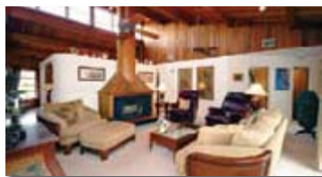
SANIBEL , 958 Sand Castle Road - Pride of ownership shows! This Sanibel home features dramatic fireplace, high wood ceilings with beams, clerestory windows and heated pool. 3 /2 (H2583) Glenn Carretta, 850-9296 $664,000