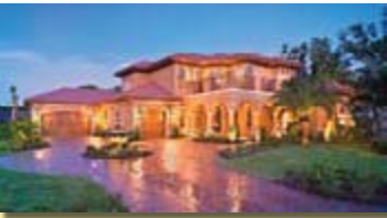
TREVI , 12131 Via Del Fontana Way - A combination of quiet sophistication & appointed detailing on this 3454 SF waterfront community estate home by Michelangelo Homes. Model home with amenities. 4+Den/3.5 (H2099) New Homes Division, 267-3706 $1,799,000