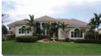
BELLE MEADE , 8641 Belle Meade Drive - This custom estate home is located in the private gated community of Belle Meade, which is only minutes away from Fort Myers Beach and Sanibel Island. 3+Den/2.5 (H2547) Barry Waddell, 464-4888 $799,000