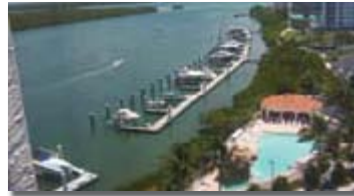
BAY BEACH , 4198 Bay Beach Ln, #1P2 - Penthouse with view from every room - Open floorplan, volume ceilings, tile throughout, SS appliances. Secure parking. Deep water dock available also. 2 /2 (C3401) Whitey Phillips, 287-2933, Holli Day, 243-6600 $760,000