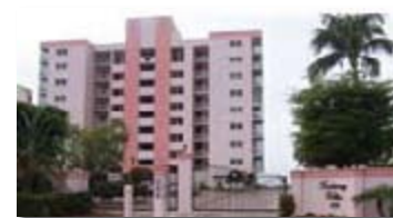
GATEWAY VILLAS , 500 Estero Blvd #495 - Delightful north end Gulf front condo is perfect for an island getaway. Gated community, views from Sanibel to Naples. Close to Times Square. 1 /1 (C2815) Meryl O'Rourke, 229-9342 $534,900