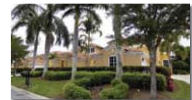
GULF HARBOUR YACHT + CC , 11037 Harbour Yacht Ct #201 - Shows like a model. Large enclosed tiled lanai with removable windows. Granite counters, gas range, equity sports membership. 3+Den/2 (C3461) Howard Farkas, 222-2600 $519,000