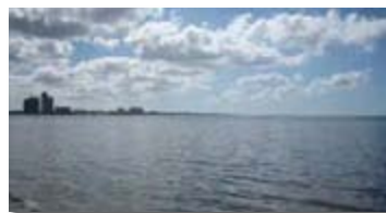
ST. TROPEZ , 2745 First St #2303 - Spectacular sunset river view looking West down the CALOOSAHATCHEE RIVER! On the 23rd floor offering upgrades & amenities galore!. 3 /2 (C2855) Cindy Livengood, 994-6700, Barbara Dunlap, 405-0251 $574,900