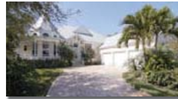
TIDEWATER ISLAND , 6051 Tidewater Island Cir - Spectacular old Florida style home overlooks beautiful Gulf access lagoon. Pool w/rock garden & waterfall, spa & outdoor kitchen. 3+Den/2.5 (H2210) Craig Conklin, 243-4265 $1,099,000