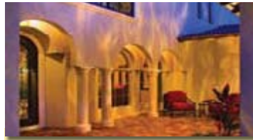
CAPE CORAL , 4907 Pelican Blvd - New custom home on canal w/direct deep water access, courtyard, dock, summer kitchen, pool, spa, travertine floors, granite counter tops, wrought iron door. 3+Den/3.5 (H2097) New Homes Division, 267-3706 $1,499,000