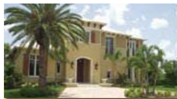
PALMETTO POINT , 6602 Griffin Blvd - DEEP WATER DIRECT GULF ACCESS. Spectacular 2-story residence w/unique balance of casual elegance, technology & comfort. Luxurious upgrades. 4/3.5 (H1022) Kathy Felszer, 851-1947 $2,995,000