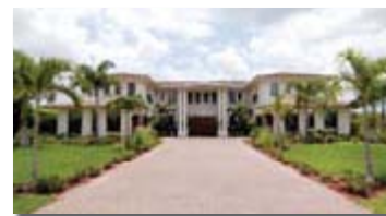
FIDDLESTICKS , 15168 Fiddlesticks Blvd - Graceful splendor. Marble and bamboo flooring flow throughout. Open floor plan, elevator, large 2 story lanai & 4 car garage. 5 /5.5 (H2522) Patricia Huether, 850-1310, Dolores Stevenson, 851-7882 $2,200,000