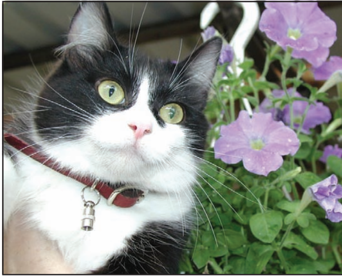
One of the secrets to having a cat use the litter box is to make sure the setup suits the cat. An unhappy cat will not use his box.

If your cat checks out fine, you need to start working to make sure that everything about the box is to your cat's liking. The second rule of solving a litter box problem: If the