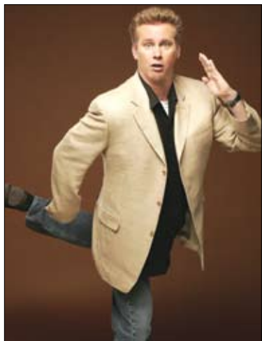
Brian Regan

Comedy Central's Brian Regan appears at BB Mann