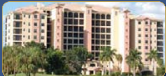
11620 Court of Palms

Palmas Del Sol ~ Lovely end unit condo with 2 bedrooms, a den and 2.5 baths. Views of river and preserve. Offered at $619,000