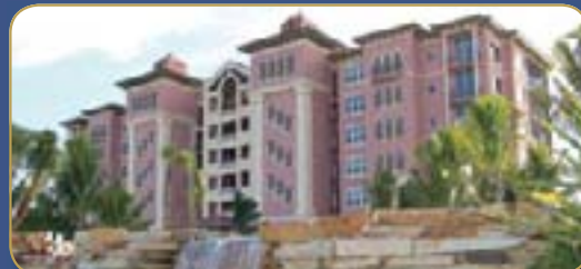
Castella at The Colony

Stunning 3 bed, 3.5 baths, 2665 sq. ft., brand new end unit. Granite counters, stainless steel appliances, lovely views. Offered at $1,249,950