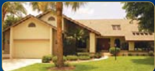
12427 McGregor Woods Circle

Lovely pool home in McGregor Woods! Wide lake views from pool. 3 bedroom, 2 bath home with vaulted ceilings. Offered at $499,900