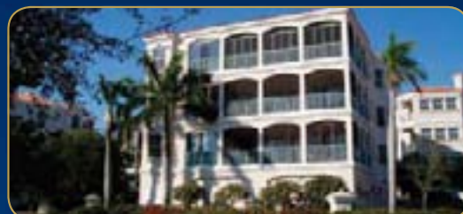
11160 Harbour Yacht Court

Beautiful 3/3 Penthouse condo in Gulf Harbour, private elevator. Only 3 condos per building. Gorgeous golf, river & Marina views! Offered at $1,100,000