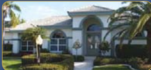
14531 Headwater Bay Lane

Fabulous lake view from this Harbourside 4 bedroom, 3 bath home. Granite & stainless kitchen & separate guest quarters! Offered at $990,000