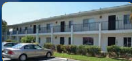
6184 Michelle Way

Martinique ~ 2 bedroom, 2 bath, 55+ community Condo. Tile, new kitchen. Pool, tennis courts and shuffleboard. Low fees! Offered at $138,000