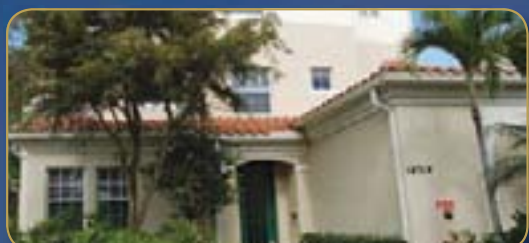
14314 Harbour Links Court

Charming 1st floor condo 3 bedroom, 2 bath with granite counters & great golf course views! Offered at $379,000