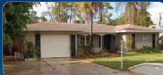
2267 Aldridge Avenue

The Villas ~ Great 2/2 pool home! New kitchen, new roof, wood floors. Offered at $249,000