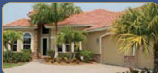
12430 Arbor View Drive

Veridian • Gorgeous 3 bedroom, 3.5 bath home on oversized lot. Granite & stainless kitchen, faux painting and much more! Offered at $759,900