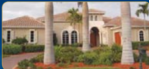
14231 Farragut Court

Admiral's Isle @ Gulf Harbour ~ Only 11 homes in this private gated community. 4 bed, 4.5 baths, library, wine room & more! Offered at $1,949,900