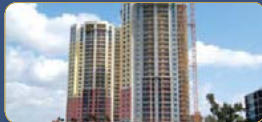
Downtown Condos! 2745 First St.

Four brand new condo's in the Riviera and St. Tropez! 3 bedrooms 2 baths, tile, granite and more. Sweeping river views, concierge service, fitness center and much more. From $617,000 to $749,000