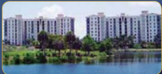
14200 Royal Harbour Court

The Shores ~ Beautiful river views from this 3 bedroom, 3 bath condo! Sports membership & furniture available. Offered at $685,000