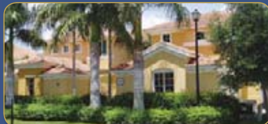
Gulf Harbour Mariposa!

Wonderful upstairs condo with 3 bedrooms, a den and 2 baths! Lovely golf course views! Offered at $449,000