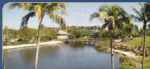
14493 Rivers Edge Court

Gulf Harbour • Spectacular water views everywhere from this 3 bed, 2 bath, top floor condo. Almost new kitchen, wood floors. Offered at $238,000