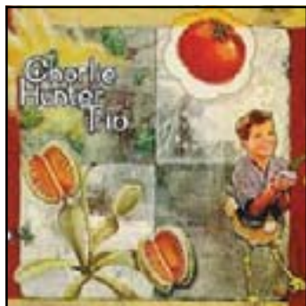
Mistico - Concord Records