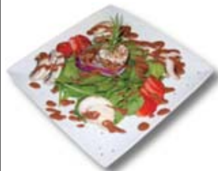
Cuisine Jayne's Victorian Garden earns FWs first 5-star rating. C19 ▶