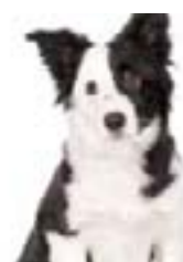
Go in' to the dogs Area pet business rescues abused canines. A25 ▶