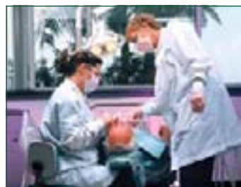
Say Ahhh Edison College dental program earns high marks. A20 ▶