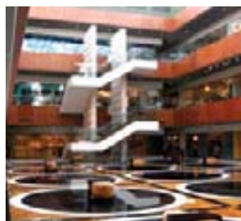
Design Center Interior design mecca down the road in Estero. B1 ▶