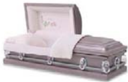
SPECIAL TO FLORIDA WEEKLY Coffins from discount retailer Costco can be shipped to 26 states in the country including Florida.