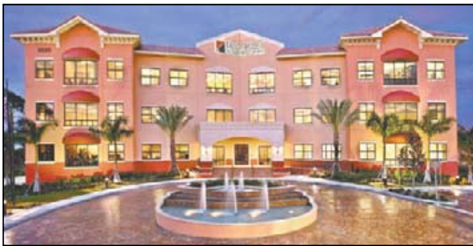
The Renaissance Center in Fort Myers, developed by McGarvey Development, is now fully leased.

McGarvey Development has fully leased the Renaissance Center, a three-story 65,000-square-foot Class A office building, located at 9530 Marketplace Road in Fort Myers.