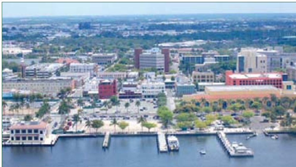
FLORIDA WEEKLY PHOTO

This aerial view from the Caloosahatchee River shows the area of the River District that will be developed into a walking promenade, additional boat docks, an open-air market and retail and restaurants, according to city plans.