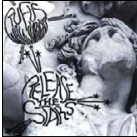
Release the Stars - Geffen Records