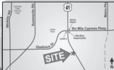
NEW FREESTANDING INDUSTRIAL (2)